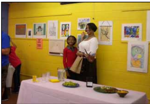
Proud parents appreciated the opportunity AAEA and Crizmac provided to showcase the artwork of their children.