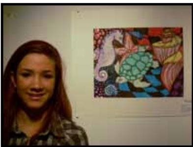
The smiles on the faces of these student artists reflect the great pride they took in their artwork and the honor of exhibiting their work at the Phoenix Art Museum.