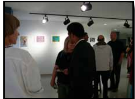
Parents, teachers and student artists enjoyed the annual YAM reception at the Phoenix Art Museum.