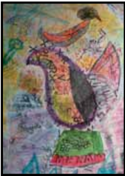
A wide variety of media was featured in the student artwork.